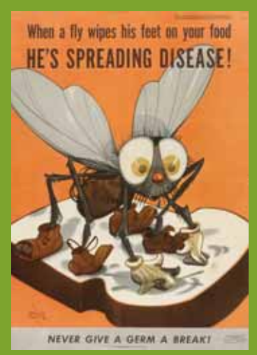
Vernon Grant, When a Fly Wipes His Feet on Your Food, U.S. Government Printing Office, 1944, photomechanical print, 36 x 51 cm.

This exhibition features more than 20 health posters from the 1920s to the 1990s. Covering infectious diseases such as malaria, tuberculosis, AIDS, gonorrhea, and syphilis, the posters come from North America, Europe, Asia, and Africa and provide insight into the interplay between the public's understanding of disease and society's values. Considered an art form, many are beautiful and entertaining, but during their heyday, they sought to educate people on matters of life and death.