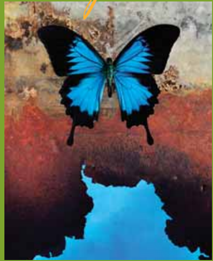
Jo Whaley, Papilio Ulysses , 2000, chromogenic photograph, 30 x 24 inches